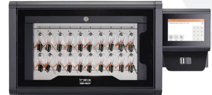
Touch Pro M (up to 40 keys)